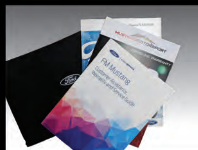
LOGBOOK SERVICING INC. OIL FILTER, VEHICLE CHECK

ORDER ONLINE NOW AT MUSTANGMOTORSPORT.COM.AU