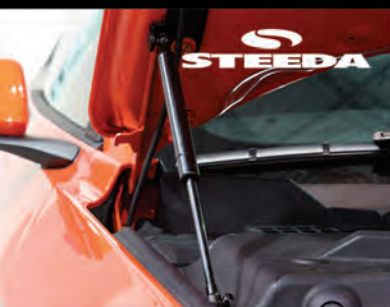
2015-20 HOOD STRUT KIT