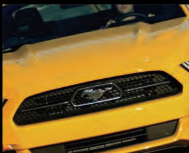
2015-17 GENUINE 50TH ANNIVERSARY GRILLE