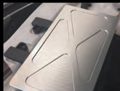
2015-20 DRAKE BILLET FUSE BOX COVER