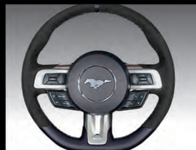
2015-20 GT350 STEERING WHEEL WITH SILVER STITCHING