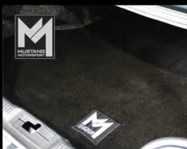
2015-20 MM BOOT/TRUNK MAT