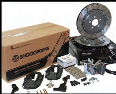
2015-20 15" SLOTTED BREMBO BRAKE UPGRADE