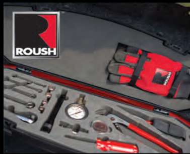
2015-20 ROUSH TRUNK TOOLKIT