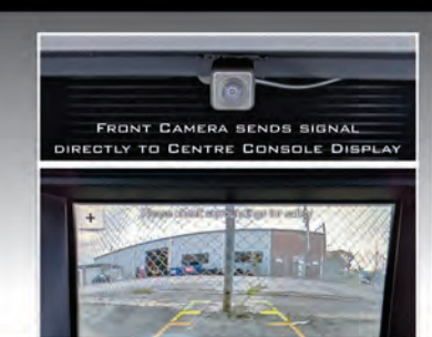
2015-20 FRONT PARKING CAMERA