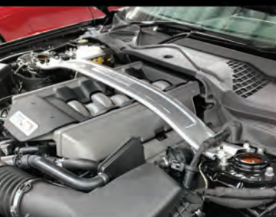
2015-20 OEM USA STRUT TOWER BRACE FOR RHD