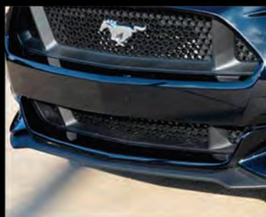
2015-17 OEM USA GT LOWER GRILLE