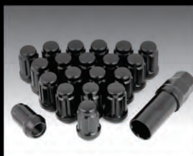
2015-20 BLACK LOCK NUT SET