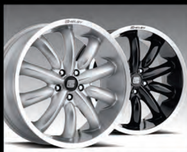
2015-20 CARROLL SHELBY CS56 V2.0 20" WHEEL SET