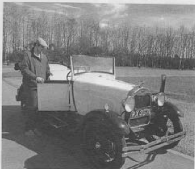
ACMC August 2017 19

Looking to the future Bob Wilkinson is keen to see other individuals, or clubs, following this car loan example to reach out to the next generation of enthusiasts and for others to tap into the process.