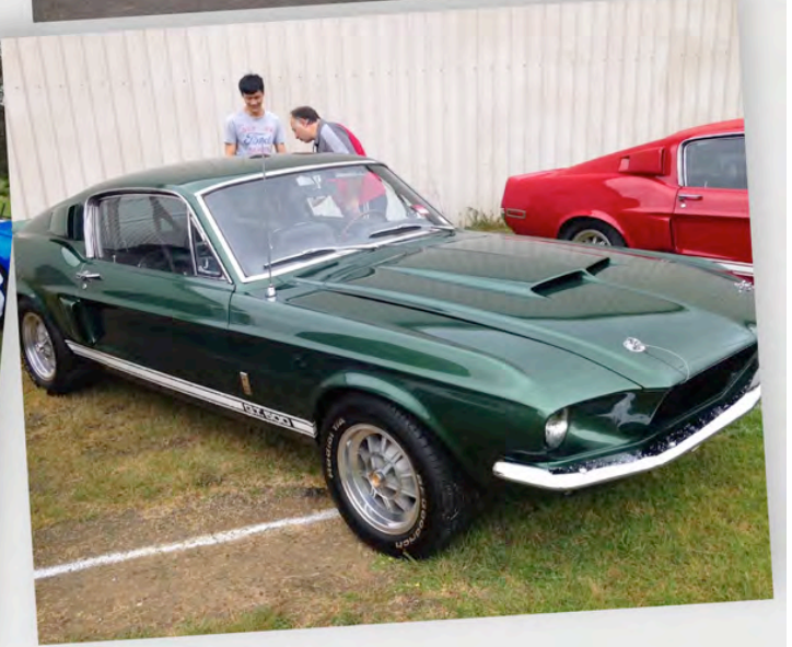
Shelbys on display at 2017 Shelby Nationals