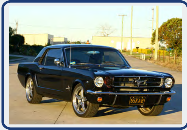
1965 LHD Coupe

Lady Owner - Vehicle Imported from California 2005