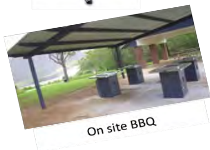
On site BBQ