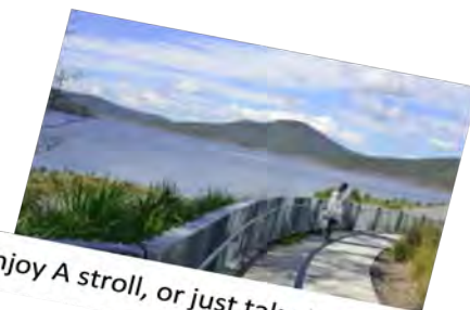
Enjoy A stroll, or just take in the scenery